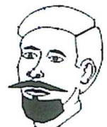
Wide mustache and beard