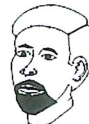
Narrow mustache and beard